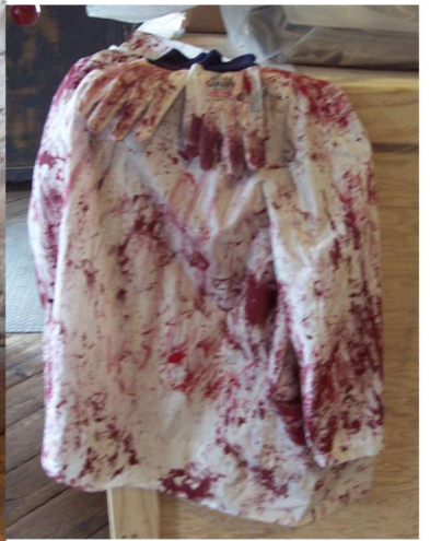
Bloody Guts : pail, guts, dentist jacket and gloves