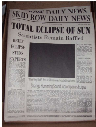
Newspaper : Front page only