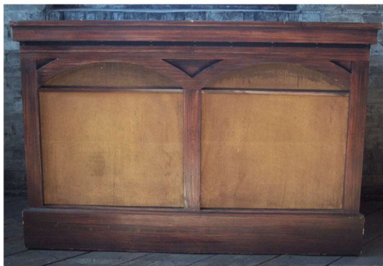
Counter Unit: with trap for A1.