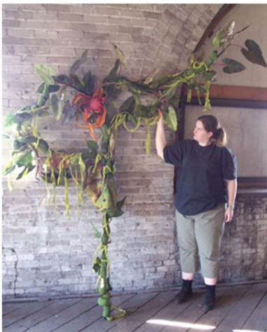
False Arm Non-moving