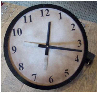
Clock : lights up and hands move